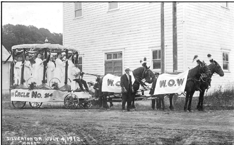
Photograph taken in 1912 by W.L. Jones of the Woodmen of the World Hall built in 1907, now the site of the Oak Street Church.

This color edition is for our on line members, please forward this email to your friends and relatives.