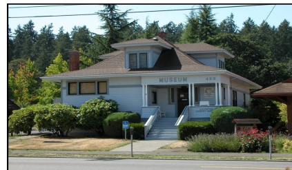
Museum and Office 428 South Water Street

Over Forty Years of History in the Making