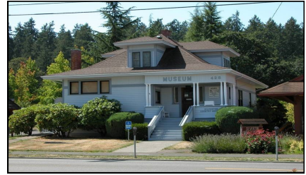
Museum and Office 428 South Water Street

Over Forty-five Years of History in the Making