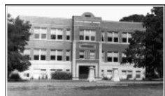
1915 High School North First St.