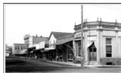
Main and First