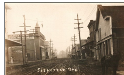
Mac's Place North Water St.