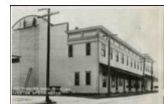
Opera House North Water St.