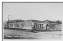
Eugene Field School