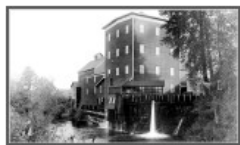
Fischer Mill (behind the Museum)

Pictured here are the supplies members use to inspect and maintain the existing plaques. We try to do this two or three times a year to clean them and try to protect them from bird droppings and soil. Most of them are holding up quite well. As the weather improves, we suggest you enjoy a mini walking tour to visit the existing plaques.