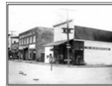
Digerness Store Oak and First