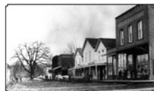
Water and Main