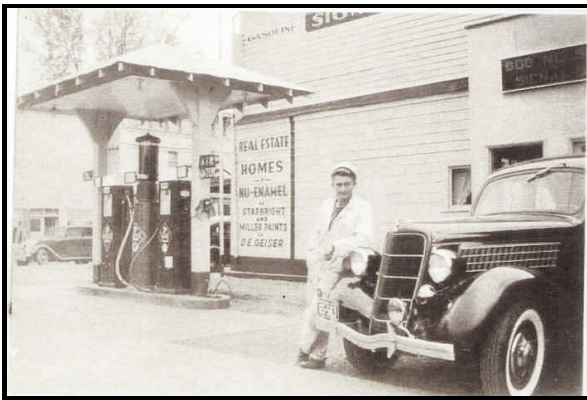
Bob's Service Station

He had to have been somewhere in the vicinity (he just knew too many details) when the high school boys rolled a train car in front of the bridge so that nobody could get onto E. Main St. via W. Main St. That was an early day Halloween prank.